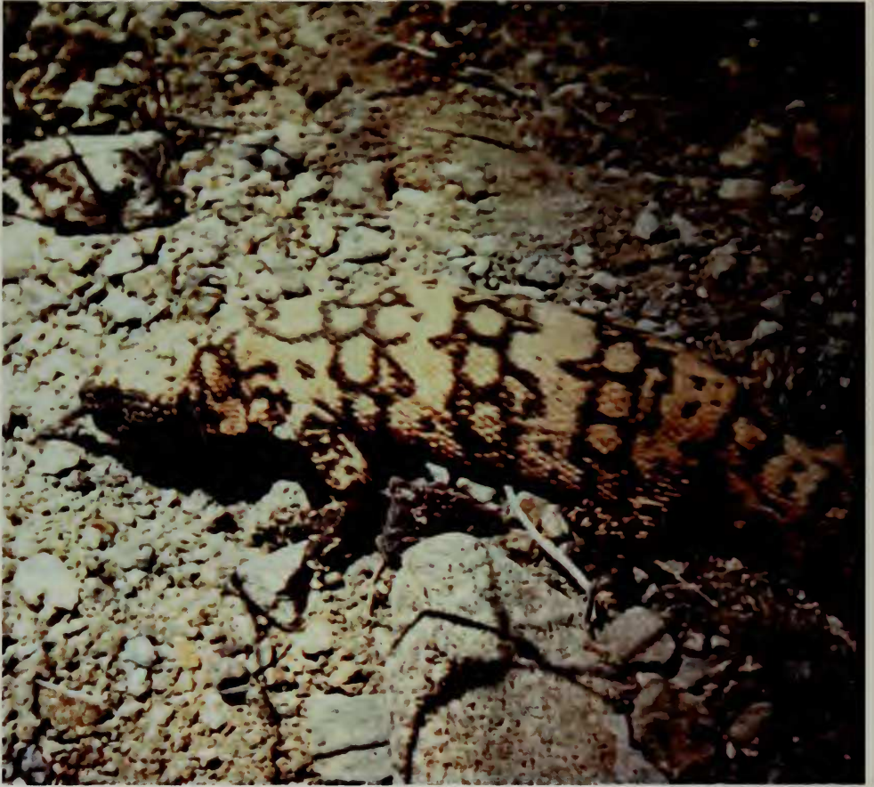
Fig. 2. The Gila monster from the Providence Mountains, Vulcan Mine Road, 16 April, 1968, 1000 hr. Photo is catalogued as Los Angeles County Museum Photographic Catalog (LACMPC) #1331.

is not the westernmost record of Gila monsters from this area (Funk, 1966). Due to the meandering course of the Colorado River, specimens from near Yuma, Arizona were found about 14.5 km west of the California record above.